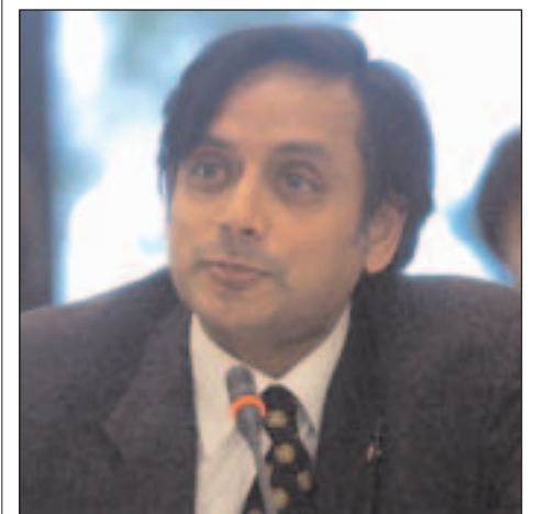
Shashi Tharoor, United Nations Under-Secretary-General for Communications and Public Information, makes a comment.