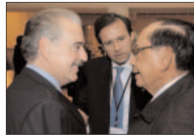
Andrés Pastrana, Jorge Quiroga, and Fidel Ramos (L-R) share a moment during dinner on the last day of the Summit.

“By working together, members of these organizations can expand their influence,