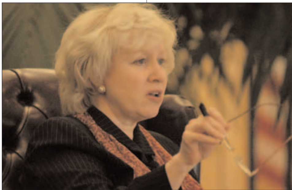
Kim Campbell, Chair of the World Leaders' Summit, stresses a point during the final discussion about how world leaders can collaborate to bring about change.

ing Ministers, as well as leaders of non-governmental organizations, academics and subject-matter experts – met during the World Leaders' Summit, June 23-25, 2005, in and around Stanford University in California.