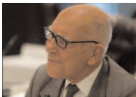
Stéphane Hessel, France's former Ambassador to the United Nations in Geneva, makes a statement after Pres. Quiroga's speech about human security.

Several ideas emerged specifically for educating the public about the dangers of nuclear,