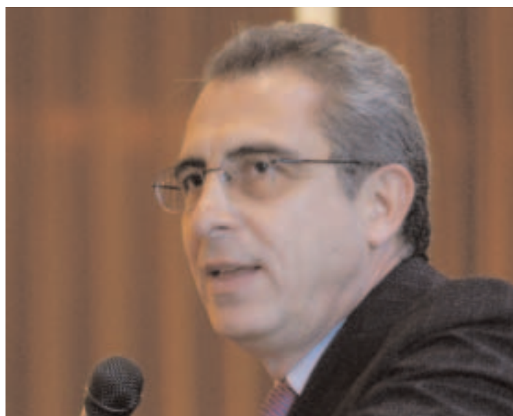
Ernesto Zedillo, former President of Mexico, urges Summit participants to work together to support both the Millennium Development Goals and arms control efforts.

The United Nations, Zedillo said, was “conceived” in