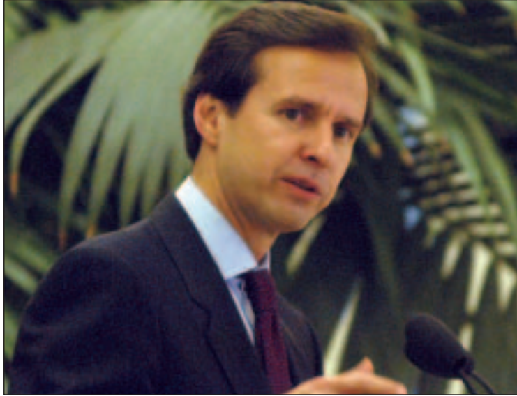
Reducing poverty will require reforms in both developed and developing nations, says Jorge Quiroga, former President of Bolivia.

T O FIGHT THE "TARZAN SYNDROME," and revive economic growth in Latin America, developing countries should create a civil service, adopt parliamentary electoral systems, and bring ordinary people into budgeting and planning, said Jorge Quiroga, the former President of Bolivia, during the Saturday morning session on promoting the safety and security of individuals.